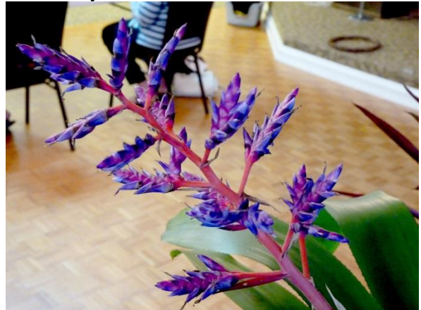
Inflorescence of Aechmea Blue Tango .

Bill had also brought in a beautiful Aechmea Blue Tango . The bloom on this plant is instantly recognizable by its eye-catching and long-lasting inflorescence. What many don't realize is that this 'electric blue' color is provided by the floral bracts and not by the flowers.