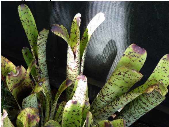
Quesnelia marmorata in California collection.

I've been asked a few times lately "what's the difference between Quesnelia marmorata and Quesnelia 'Tim Plowman', so I thought these photos might clear up any confusion. Quesnelia marmorata resembles a typical Billbergia with its tubular shape and slightly flaring leaf tips.