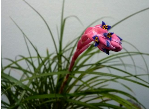
Fernseea bocainensis bloom.

around. Only then do the actual flowers make their appearance.