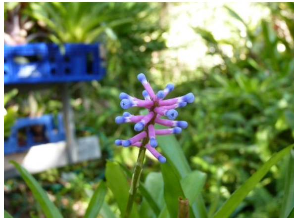
What is it? Aechmea gamosepala , with its distinctive "crossed matchstick head" is usually in bloom in our area from December until February.

According to the BSI Cultivar Registry, Quesnelia 'Tim Plowman' was registered as a cultivar in 1983 following collection of this plant in the wild by D. Sucre in Rio de Janeiro. The plant was given an identification number of "Plowman 12968".