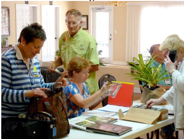
It's typically a busy head table before the meeting gets underway!

BSI recently announced the date and location for the next Bromeliad World Conference and so, we thought that it would be appropriate to show photos from the 2016 World Conference that was held in San Diego, California to give our members a taste of what world conferences are all about. The PowerPoint presentation showed what to expect from one of these events – the banquet, the seminars, the judges school, the judged bromeliad show, tours of nearby gardens, not to mention the people from all over the world and, of course – the bromeliads! As the name implies, BSI World Conferences have been held in many far-