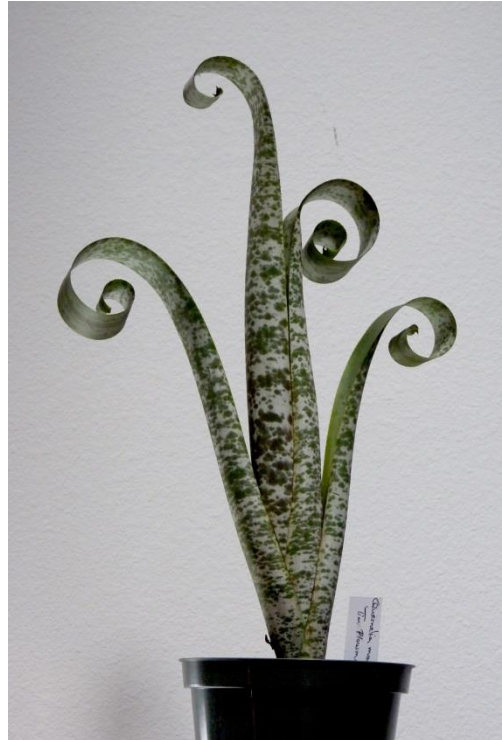
The unmistakable curl to the leaves identifies this as Quesnelia 'Tim Plowman'

The inflorescence is larger, more colorful and longer lasting than Q. marmorata .