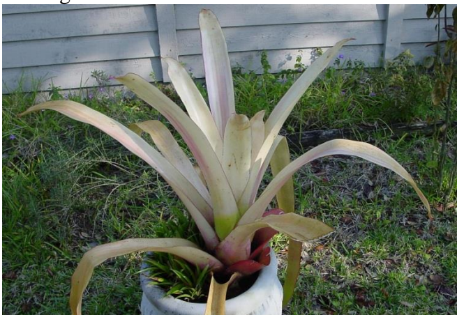
Aechmea blanchetiana after a 27degree F night in Port Orange. No, that's not a rare albino form of this plant. This is what extreme cold damage looks like in a bromeliad and it's the reason why it is a good idea to have a ready supply of frost cloth handy before Winter suddenly shows up on our doorstep.

The second photo, from the FCBS website, shows what their ultimate display will be: Still not impressed? How about if I tell you that these blooms will hold their color for up to 6 months without fading? Now that's an outstanding plant for anyone's yard! Of course there <u>is</u> a minor drawback – Aechmea blanchetiana has a reputation of being somewhat cold-tender, so you need to be prepared to provide some cold protection in our area if you want your plant to stay looking nice.