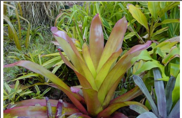
Another Aechmea blanchettiana after 27 degrees, but covered with a single layer of frost cloth.

This plant doesn't need an extraordinary amount of protection in our area, but in a typical Daytona Beach area winter you will need to cover Aechmea blanchetiana for those 2 or 3 nights when the temperature drops below freezing.