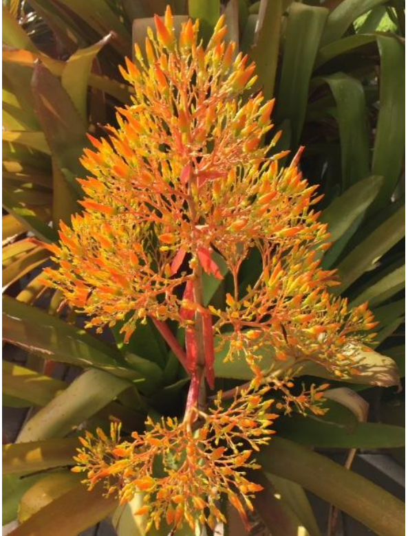
Aechmea leptantha Editor's note: Formerly known as Portea leptantha, this plant has not only had its name changed by Elton Leme and Jose Filho in 2007, they re-assigned it to a whole different Genus! Padilla in her book Bromeliads notes that the name 'leptantha' refers to the many slender flowers that make up this spectacular inflorescence. Native to Brazil, this plant can be found growing in full sun and makes a great addition to the landscape – although some protection from the cold may be necessary if the temperature drops too low in the winter. – JT

found this beautiful Aechmea leptantha at Tropiflora. A species formally apart of the portea subfamily, it stands at almost 4' tall with colorful green yellow leaves. Unfortunately it's a little on the sharp side, with healthy (and hungry) spines. A beauty of a bloomer!