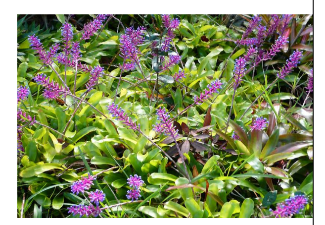
#3- I've found the above-pictured plant to be a very reliable bloomer, cold hardy, and just a pleasure to have in the landscape. As a bonus...it blooms right around Christmas time!

Last month's "Name that plant" photos were: 1. Tillandsia utriculata – this plant is found in our area. You may have to search to find a tree harboring this, the largest of the Florida native bromeliads, but some trees hold quite a few nice examples.