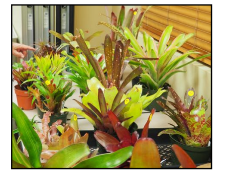
Sale Table Selection