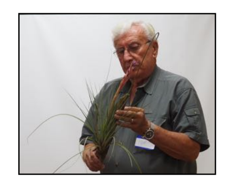
Till x Floridana