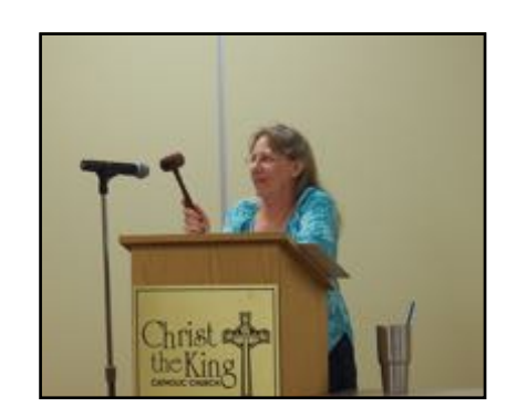
Call to Order