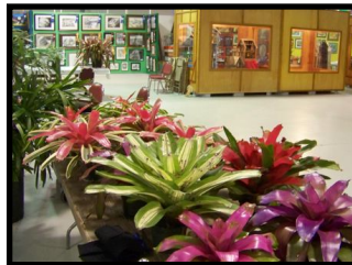
Waiting to be Tagged & Placed