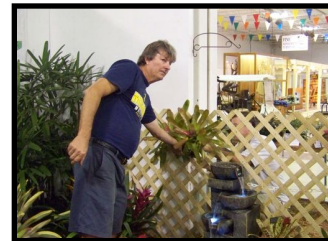
Placing the Plants