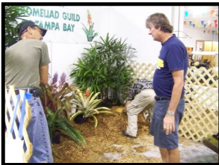
Beginning to Set Up