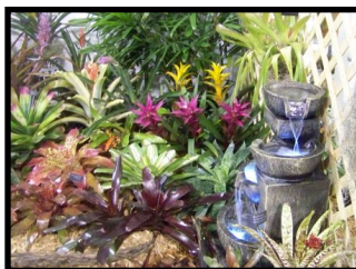
Our New Fountain