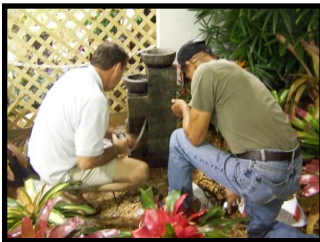
Assembling the Fountain