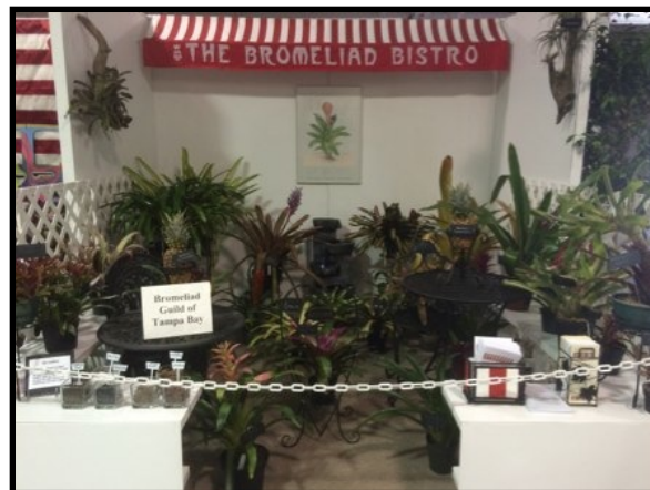
Florida State Fair Display