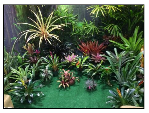
Our Florida State Fair Display

We will begin the new raffle procedure at the March meeting. Tom Wolfe will explain the new plan in detail at the meeting next week.