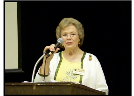
Meeting Called to Order