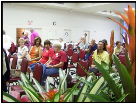
Waiting to begin ...