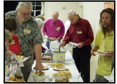
Great Food, as Always!