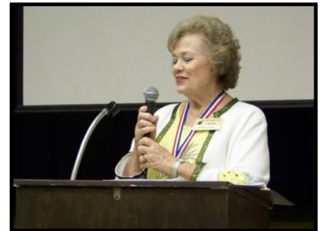
Call to Order