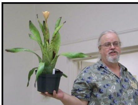
Barret's Show & Tell