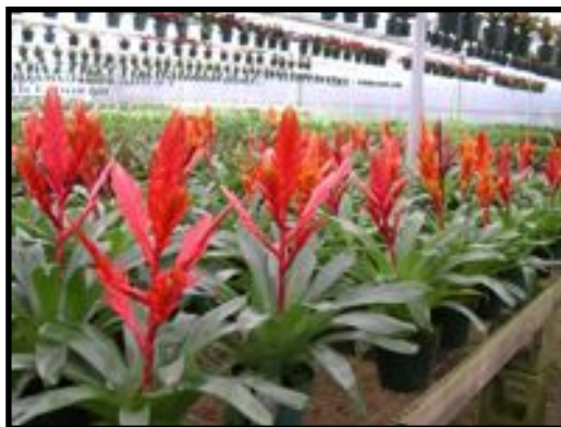
Color Zone Tropicals