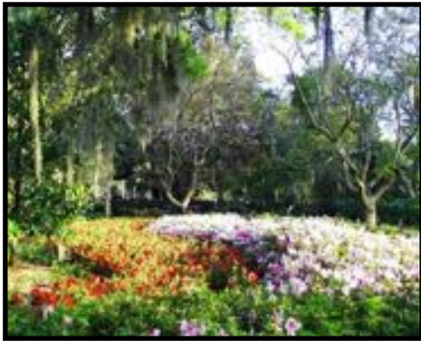
Harry P. Leu Gardens