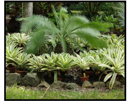
Block Botanical Gardens