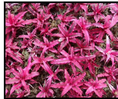
Block Botanical Gardens