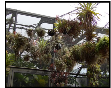
Block Botanical Gardens