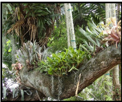
Block Botanical Gardens