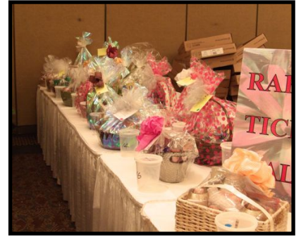
Hundreds of Baskets to be Ruffled