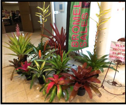
Display in the Hotel Lobby