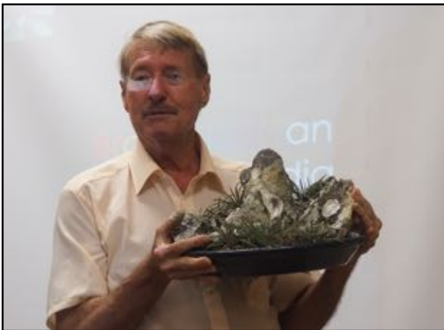
Workshop -Bromeliad Dish Garden Dyckia choristaminea, by Kenneth Stokes