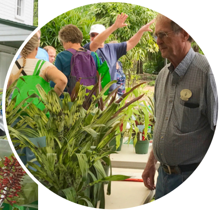
Long lines, happy customers, and great member participation! Thanks to everyone for a really fun event.