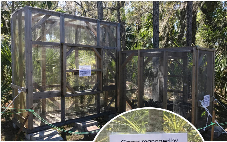
The giant airplants live in cages to protect them while they are going to seed