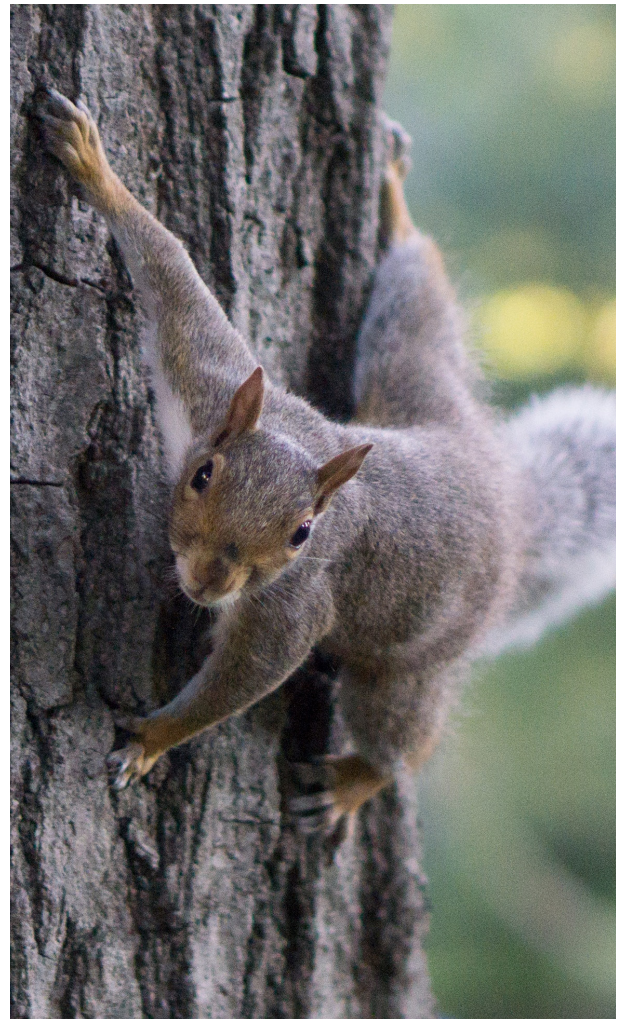
What, ME . . . a destructive nuisance?

The best solution might be to look for a dog named Dug. Only I don't remember him catching many of the varmints. 😊