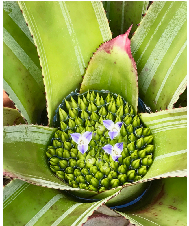
Neoregelia cruenta 'Silver Bullet'