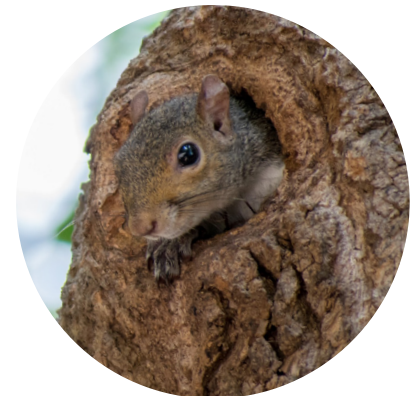
Neoregelia 'Sheba' was delicious!