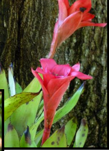
An urn filled with irises, intermingled with the vast number of bromeliad, is a visual treat.

Below are the typical tulip like blooms of the genus Canistrum, this plant, I believe is C. triangulare .