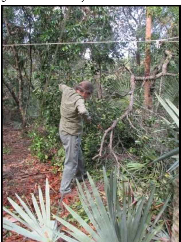
Figure 1. Martha Pessaro cuts away a tree that fell in Magnolia Loop Garden.

The Enchanted Forest Sanctuary was hit by tropical storm Hermine on 1 and 2 September 2016. There were gusts of wind up to 70 mph and a lot of rainfall, but the giant airplants ( Tillandsia utriculata L.) growing in the Gardens and Protected Site in the forest were undamaged. Hurricane Matthew, which passed through the Titusville area on 6 and 7 October 2016, posed a much greater threat. The day before Hurricane Matthew hit the Titusville area, Martha Pessaro, Lora