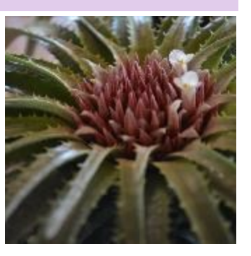
Orthophytum albopictum