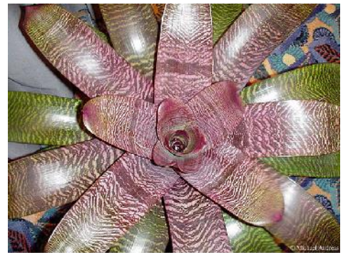
Vriesea 'John Hirota' Shown by Bromeliads Hawaii 14th World Bromeliad Conference, San Francisco, California June 20--July 1, 2006