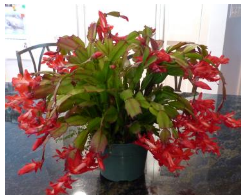
Ringer! Though not a bromeliad, this Christmas cactus ( Schlumbergera species) is lovely still.