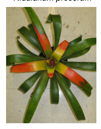
Guzmania sanguinea var. sanguinea