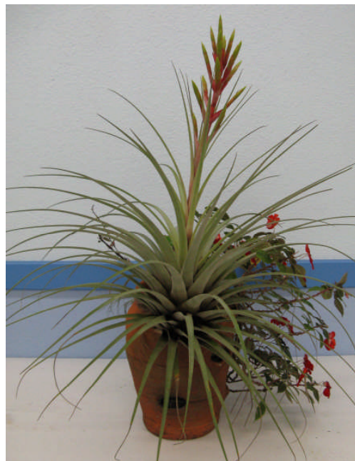
Til. fasciculata var. densispica