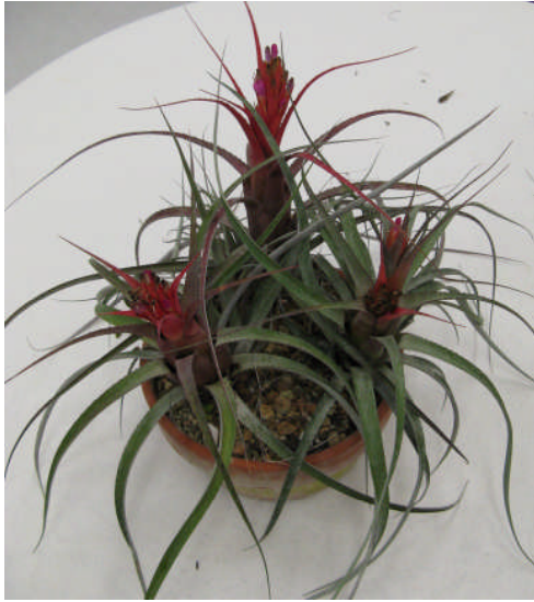
Aec. recurvata (three cultivars)