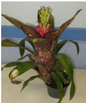
←← Bil. 'Hallelujah' x stolonifera .→→