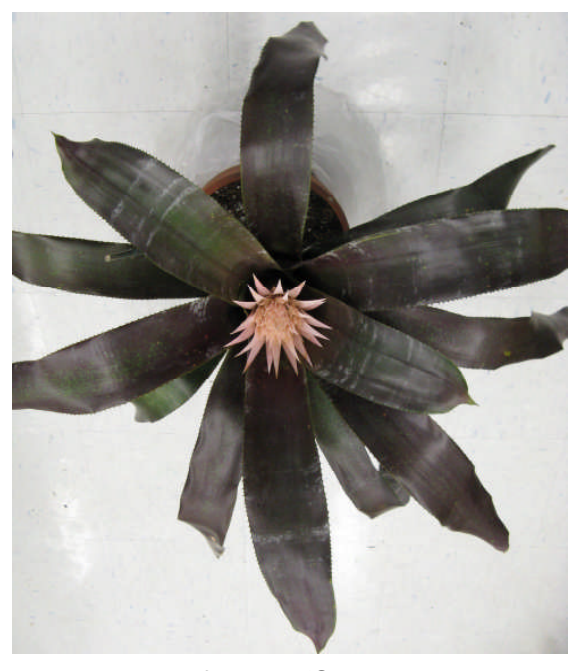
Aec. fasciata 'Sangria'