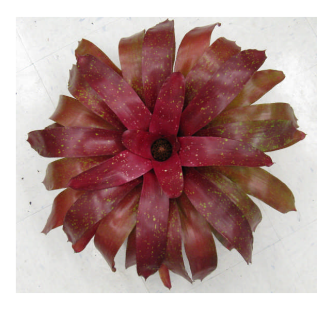
Neo. 'Treasure Chest' X 'N. Bingito'