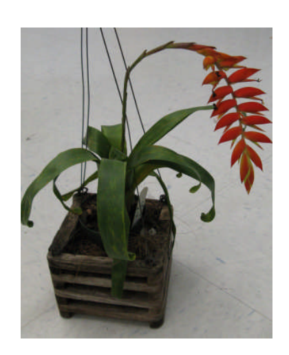
←← Til. dyeriana