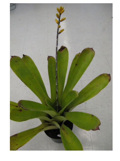
THIS AND THAT