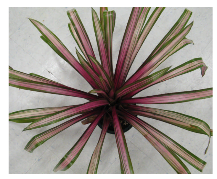
Guz. 'Symphony' variegata