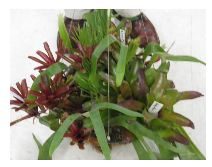
Basket of bromeliads and staghorn fern \leftarrow \leftarrow \leftarrow