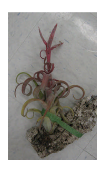
Til. 'Curly Slim'