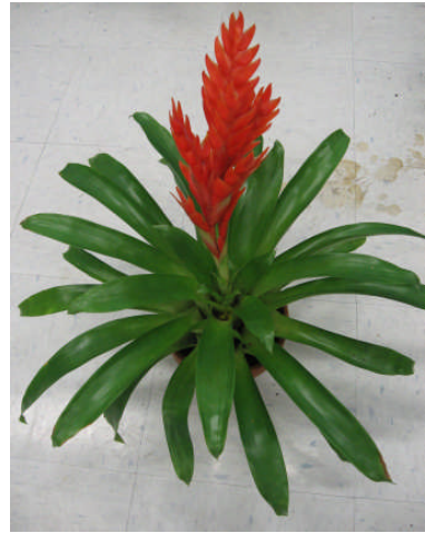
Vriesea unregistered hybrid