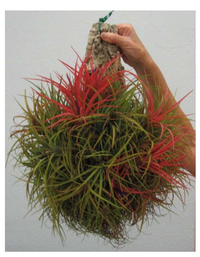
Til. brachycaulos or Til. 'Victoria'