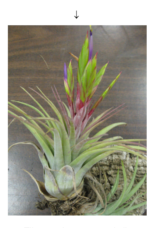
Til. concolor x streptophylla

A cross of the two plants pictured above produced the hybrid below.