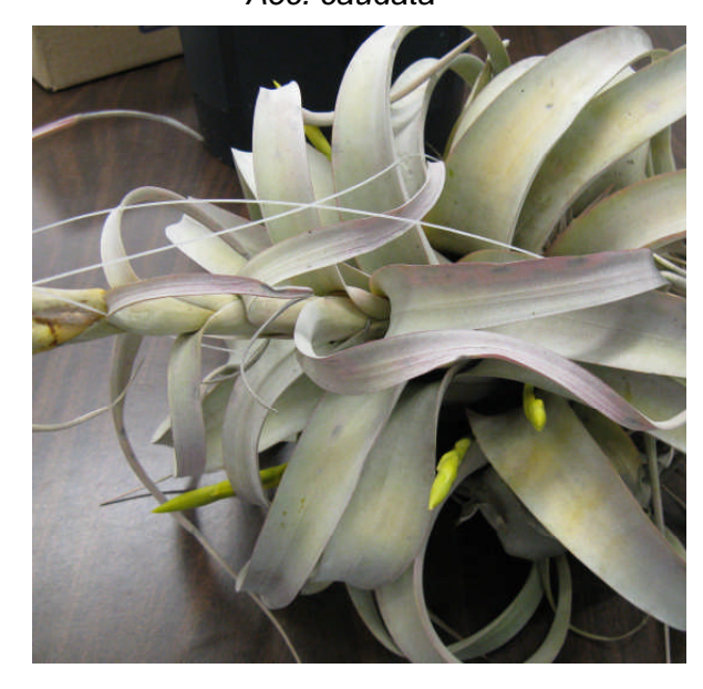
Til. xerographica, with pups at leaf bases