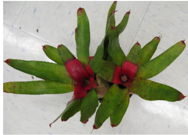
Neo. 'Heart's Blood'