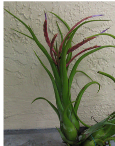
Til. 'Curly Slim'