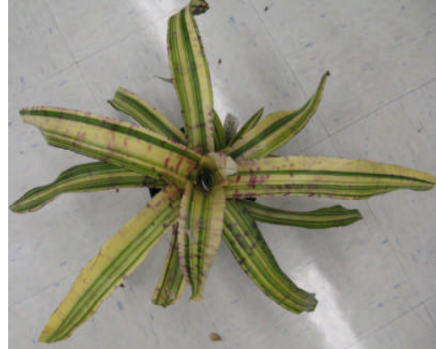
Neo. ('Hannibal Lector' x carcharodon) x (johannis x 'Tiger') x 7260 (Neo. species Brazil)