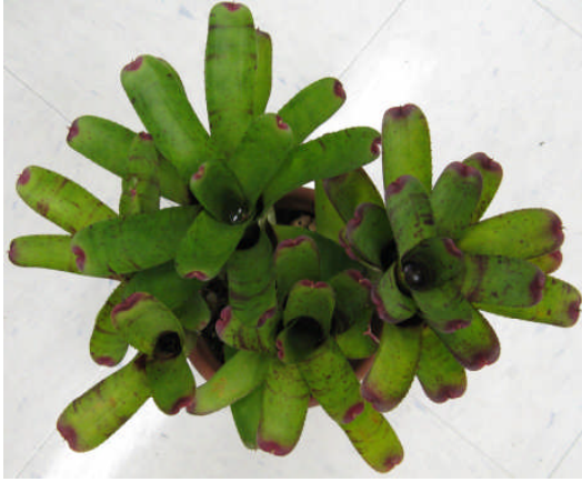
Neo. 'Little Faith'