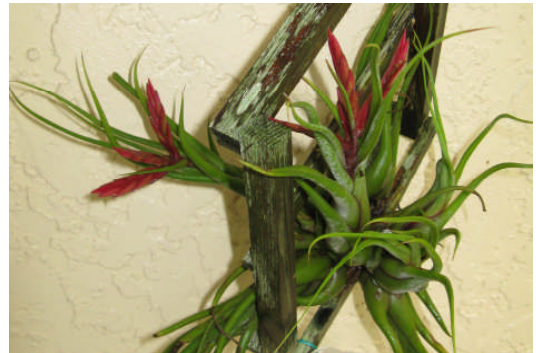
Til. 'Purple Passion' ( seleriana x tricolor )