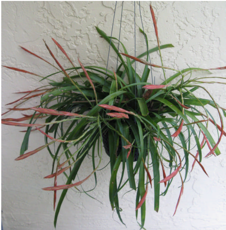
Til. flabellata (large form)

Below are pictures of some Show and Tell plants from the June meeting that were not available for the June newsletter.