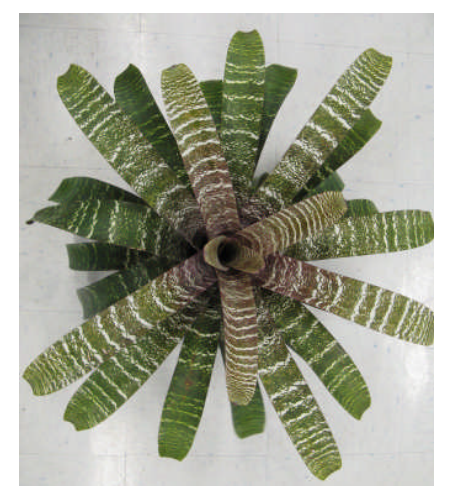
Vriesea 'Red Chestnut' hybrid (left) and two unnamed Vriesea hybrids