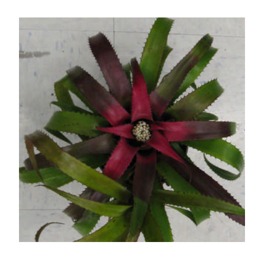
Neo. 'Brown Recluse'