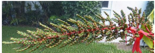
(Close-up of bloom stalk)