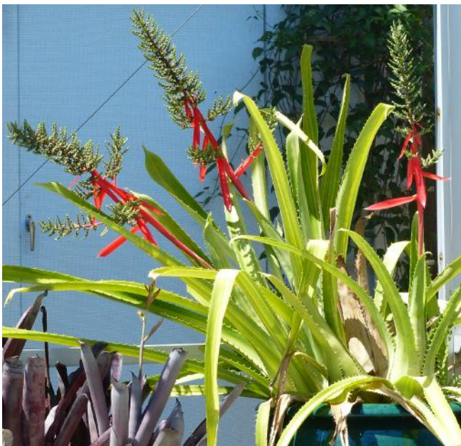
Aechmea bracteata var. pacifica , variegated