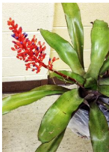
Aec. miniata var. discolor