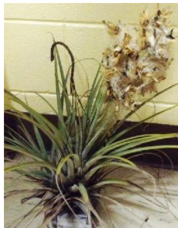
Til. fasciculata , with seeds