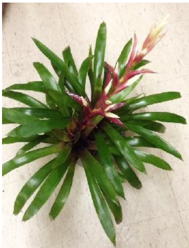
X Guzvia Vriesea 'Happa'