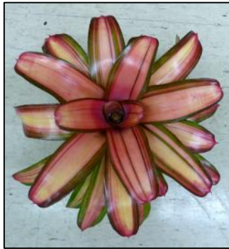
Neoregelia 'Lorena Lector'