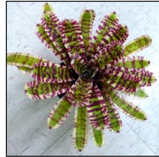
Neoregelia 'Wild Rabbit'