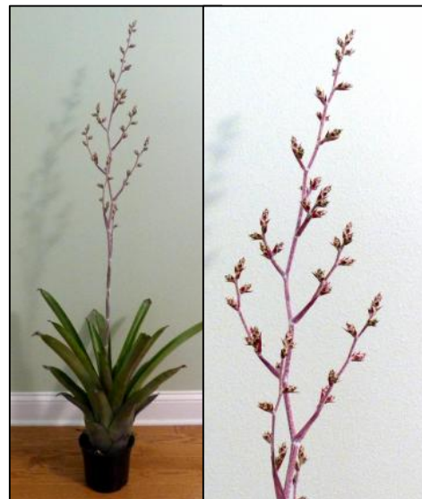
Hohenbergia 'Purple Majesty'