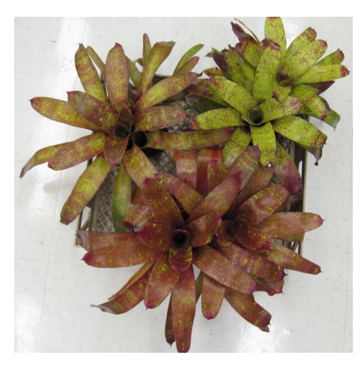
Variations of Neo. 'Bengito' x 'Hannibal Lector'