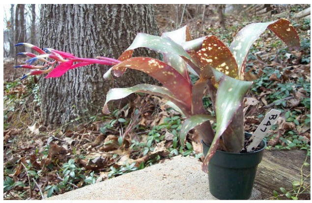
Billbergia 'Stimpy'