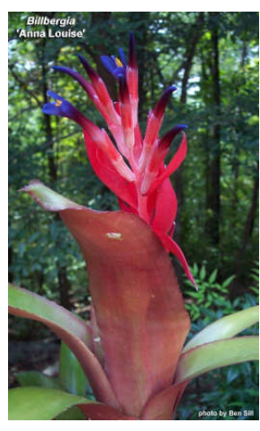
Bil. 'Anna Louise'