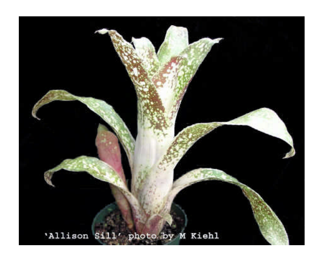
Bil. 'Allison Sill'