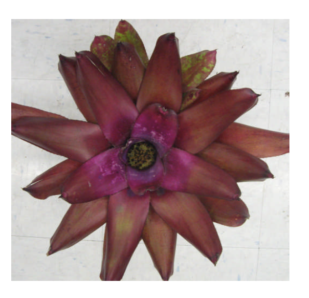
Neo. 'Hija Morado'