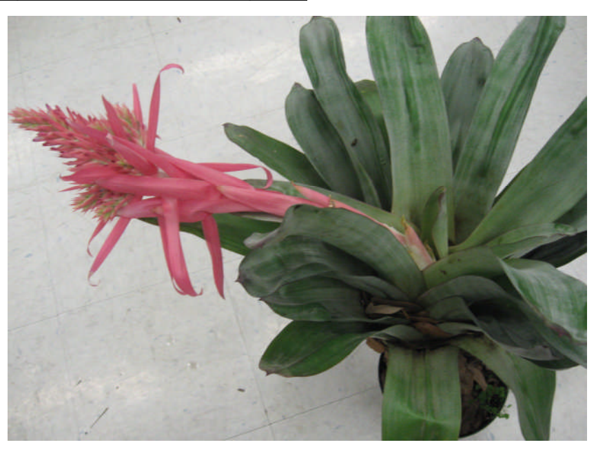
Aec. 'Star of Linda'