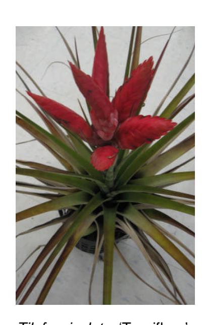
Til. fasciculata 'Tropiflora'