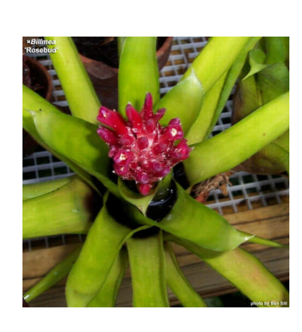
X Bilmea 'Rosebud'