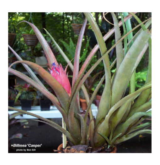
X Bilmea 'Casper'