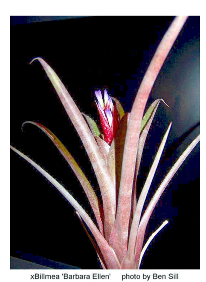
X Bilmea 'Barbara Ellen'