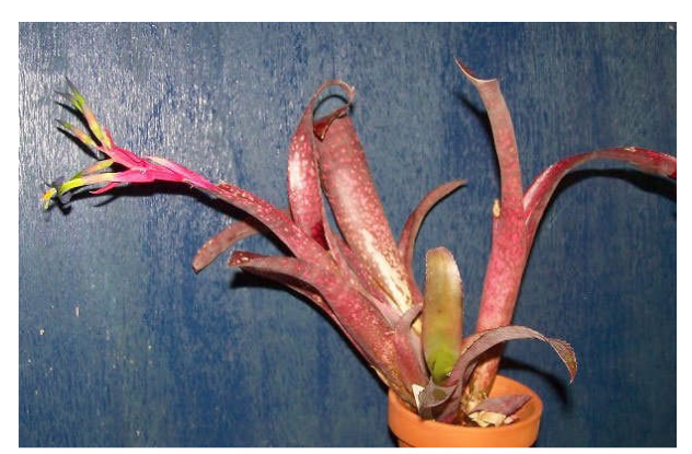
Billbergia 'Crimson Candle'