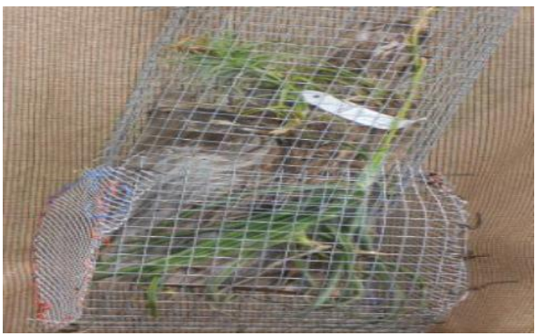
Thanks Bill for reminding us all that squirrels may look cute and fuzzy, but they surely can

CATS? That's a brilliant idea, unless you have 5 that have been trained by the pacifist mother to "not harm" the horrid little tree rats. If I could find a couple of splat squirrels, I could put their rotten little heads on bamboo spikes as a warning of what's in store for the remaining mini terrorists. In the end, I saved one Duratii and one Sweet Isabell- not sure how happy they are but they are safe behind wire. The pacifist claims it's looks like a cage for bromeliads gone bad.