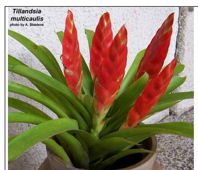
Multiple blooms on one plant! Tillandsia muliticaulis