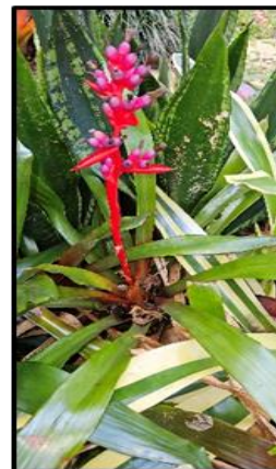
Aechmea weilbachii forma leodiensis