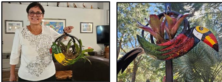
Iris Graim holds baskets made from recycled rubber tires which she planted with bromeliads.