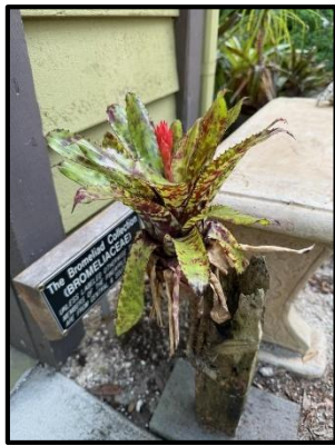
Aechmea 'Goldtone' (Calandra Thurrott)