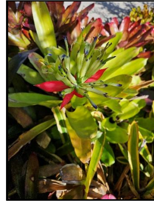
Billbergia amonea