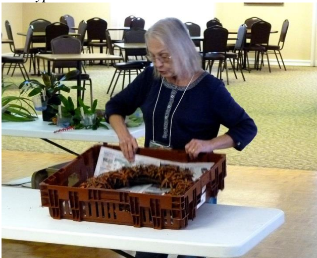
The plastic tray is first lined with old newspapers to retain moisture.

Case in point: Cryptanthus are strictly terrestrial in their natural habitat and are generally considered a poor choice to mount on wood. Rose, however showed us that by lining a plastic tray with newspaper and soaking the paper with water, a wreath made of vines provides the perfect support for a mass planting of Cryptanthus bivittatus .