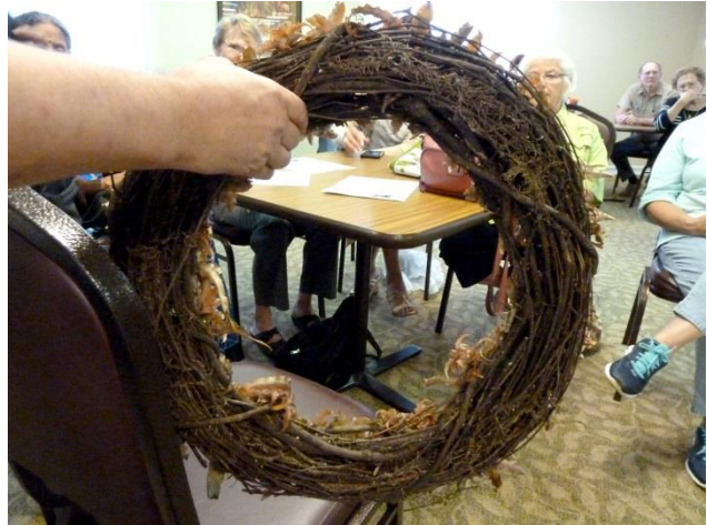
The back side of the wreath shows how Cryptanthus roots have worked their way through the wreath to reach moisture – securely anchoring the plants to the entwined vines.

The plants not only survived, but produced such large numbers of offsets that the wreath was soon completely covered with these small bromeliads.