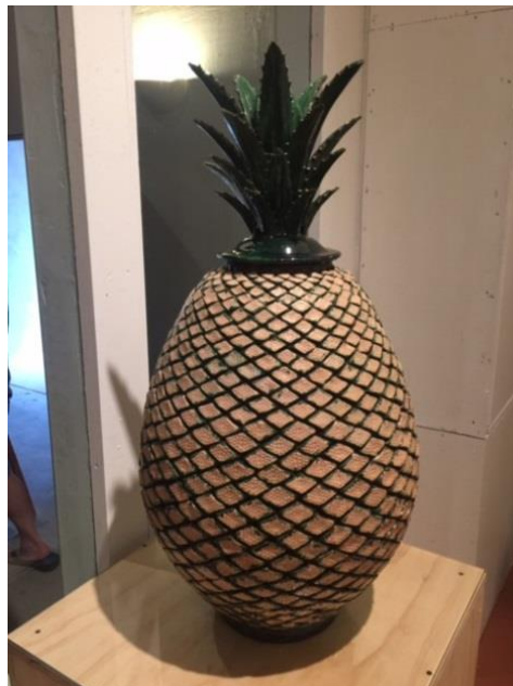
And by the way, archeological evidence shows that there has been human habitation within the territory of the Mexican state of Michoacan for at least 10,000 years. Please note: wine and bromeliads are very fascinating while enjoyed together.