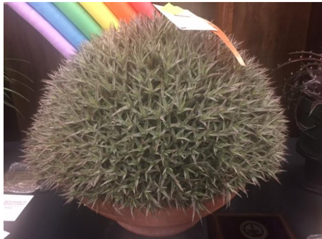
Deuterocohnia lorentziana