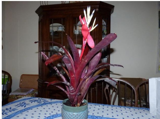
Billbergia 'Flamenco' makes a nice display for any home.

Other bromeliads in my yard seem to be on their usual schedule for blooming, so I have to wonder whether the blooms of some of these plants are triggered by photoperiod (how many hours of daylight they see), by maturity (when they're old enough, they bloom) or by average temperature. I suspect that the answer depends entirely on the Genus and species of plant, but with at least some bromeliads, unusual weather conditions can be a factor.