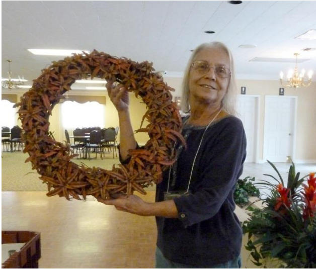
Wreath completely covered in Cryptanthus plants

Our own Rose Vincel not only showed us how to make a beautiful wreath using bromeliads, but she also demonstrated that you can't believe everything you hear concerning Cryptanthus and their appropriate care!