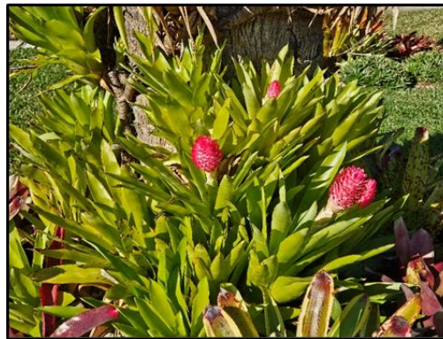
Quesnelia testudo