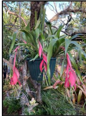
Billbergia nutans