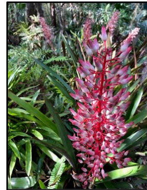
Portea petropolitana