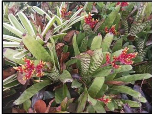
Aechmea 'Bert'