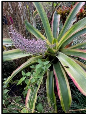
Aechmea mexicana