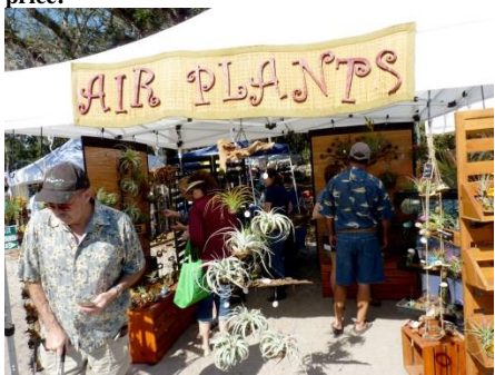
The sign says it all!

Vendor selling succulents also offered Cryptanthus at a bargain price!