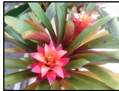
Guzmania 'Tutti Fruitti' (Judith Davies)

You can force them to bloom by placing a ripe apple inside a plastic bag and then covering the plant with the bag. Leave covered for 2-3 days and then remove the bag. Blooms should start to develop in about 6 weeks to 3 months.