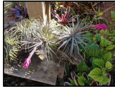
Tillandsia stricta (Jane Villa-Lobos)