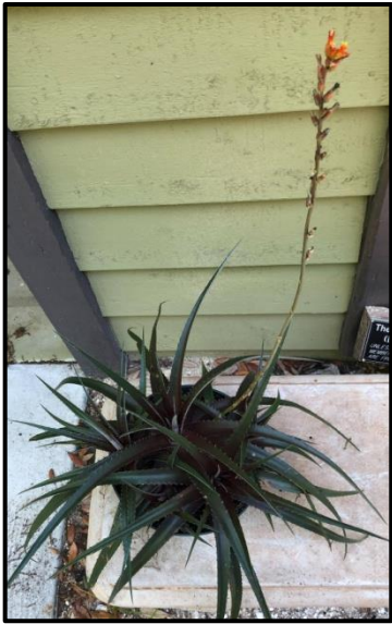
Dyckia 'Red Devil' (Calandra Thurrott)

The deep green spiny leaves are tinged with dark coppery-red that intensifies in full sun. Spring and summer flowers are burnt orange.