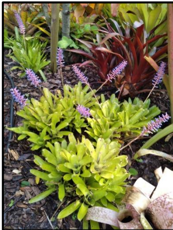
Aechmea gamosepala Matchsticks (Marinus Grootenboer)

We love to see pictures of bromeliads in our members' gardens.