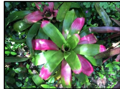
Neoregelia 'Cotton Candy'