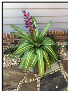
Aechmea 'Del Cielo'