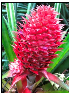
Ananas bracteatus