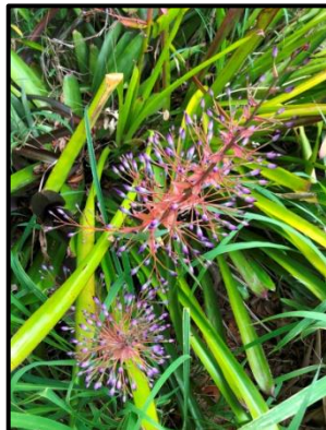
Portea petropolitana