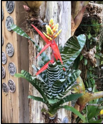
Aechmea chantinii 'Rebecca'