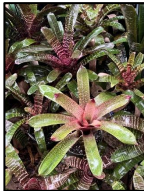
Vriesea 'Pride of Hilo'