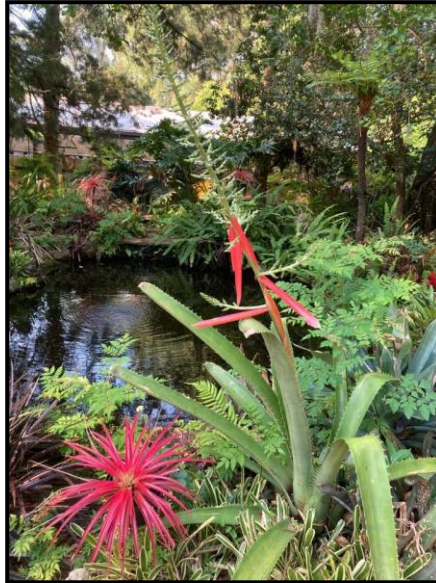
A. bracteata & Sincorea