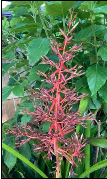
Portea petropolitana