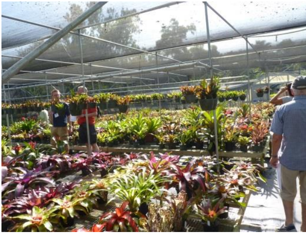
Jimbo's bromeliad nursery outside of Houston

And, there is always a fabulous plant sale – worth the trip just by itself!