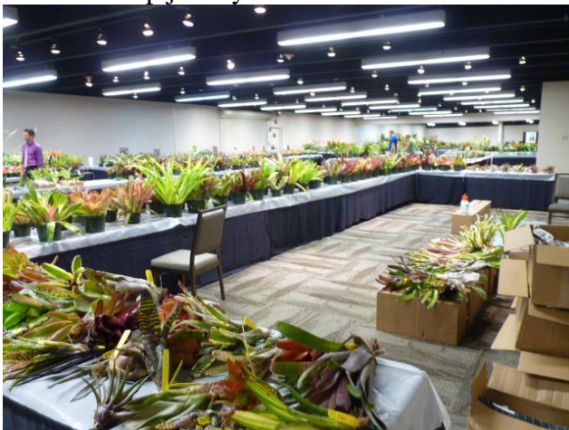
That's a lot of bromeliads!!!

And, there is always a fabulous plant sale – worth the trip just by itself!