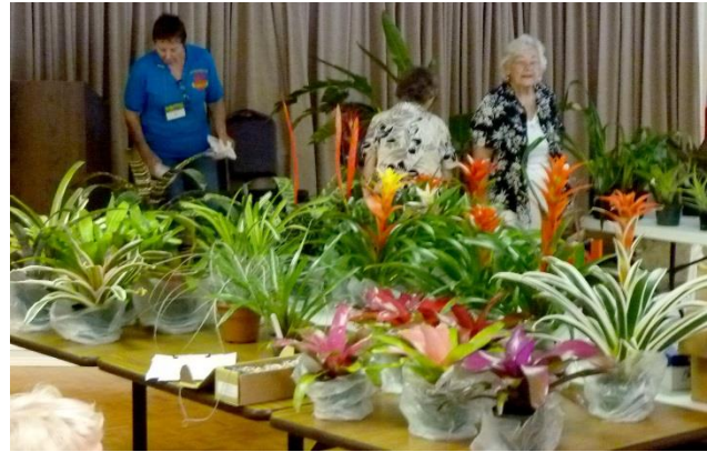
A few of the many beautiful bromeliads offered as prizes in Bingo!