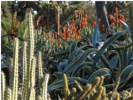
Huntington Gardens – succulent collection

of succulents and xeric plants from around the world (some specimens I saw were over 100 years old!) there were a few Dyckias and an island of Puya berteronianas. The tropical and subtropical areas had Billbergias, Aechmeas, Tillandsias and Neoregelias, but not many. My advice is if you want to see a vast array of bromeliads, go to Fairchild or Selby Gardens. The art at Huntington included American and European sculptures and paintings- one of which was Thomas Gainesborough's "The Blue Boy". The literature collection had a Gutenberg Bible, handwritten letters from Lincoln and Louis Pasteur, maps dating back to the 13th century, 420,000 rare books and 7 million manuscripts. It was an incredible day! Everybody enjoyed it and we got exercise to boot! If you go to LA I would highly recommend visiting the Huntington. Check out Google images for a taste of what's there.