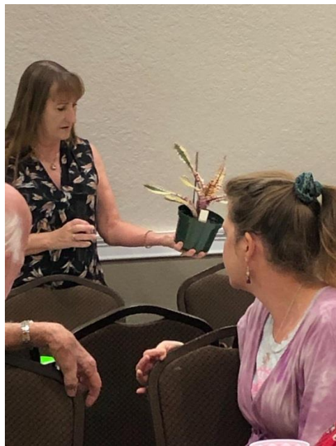
Another outstanding example of a hybrid Neoregelia by Chester Skotak