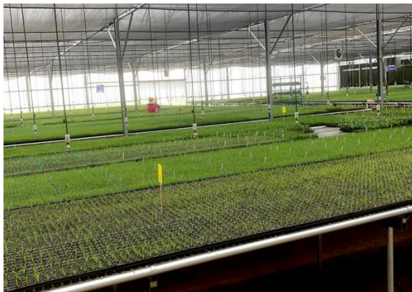
These are all seedling bromeliads!

Recently we had the opportunity to visit the wonderful folks of Phoenix Foliage in Winter Garden and what a treat that was! I took a photo to give you an idea of what over 600,000 bromeliads looks like. That's right – over 600,000 bromeliads in their greenhouses, but that's not all they grow there. Many different types of tropical foliage plants...lots and lots and lots of them!!