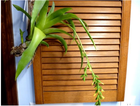
Catopsis nutans .

traded between the two plants. In the case of the non-Florida varieties of Catopsis nutans , the flowers on the male plant are also smaller than those on the female and in addition, are borne on short branches on the inflorescence. As these photos show, the flowers on my C. nutans are small and there are at least two short branches on the bloom spike – a feature not found on the female plants (also not expected to occur on the Florida variety).