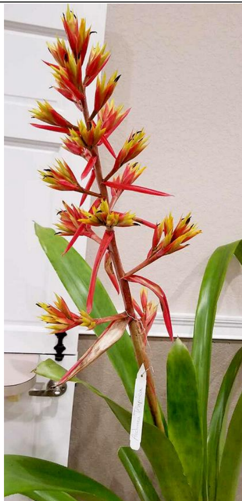
Bloom spike on Jay's Aechmea Tropicca.