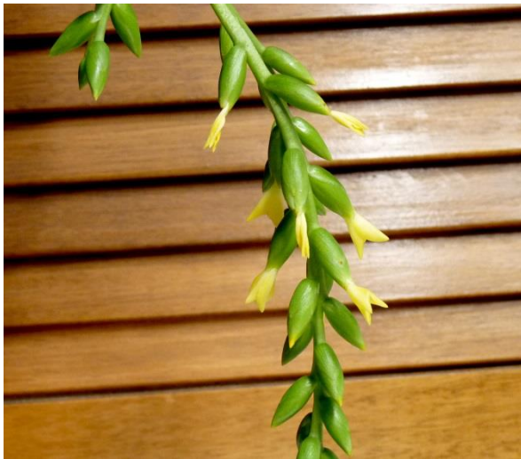
Small yellow flowers in inflorescence with several short branches.

If you purchased any of these plants at our club meeting, please be advised that the correct name should have been given as Catopsis nutans and not “ Catatopsis ”, although, I kind of like the sound of “ Catatopsis ”, ...especially if it is mounted on a hot tin roof!