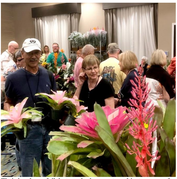
Their hands are full, but surely they must need just one more?