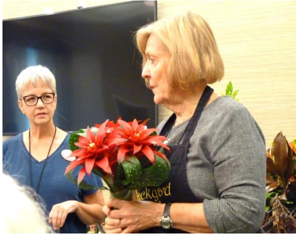
The "Backyard florist" demonstrates using bromeliads in floral arrangements