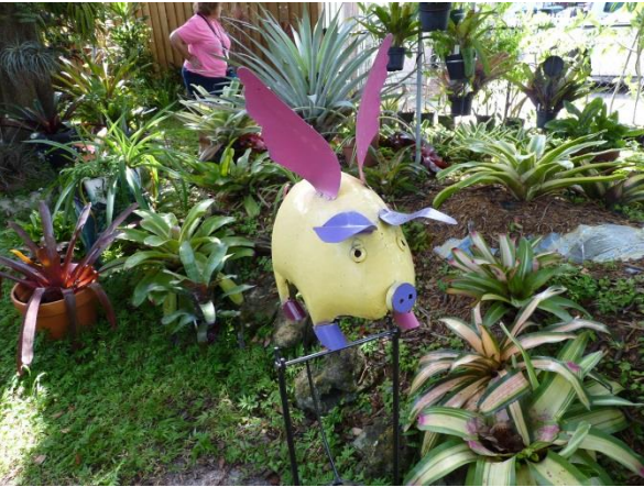
Pigs fly in Lisa's front yard!