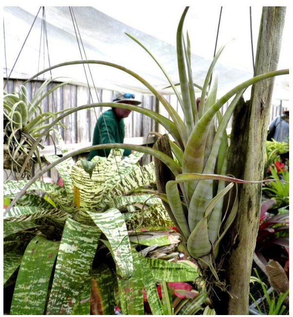
Tillandsia flexuosa mounted on driftwood next to Vriesea ospinae gruberi cultivar