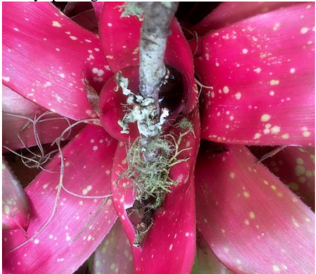
Neoregelia Treasure Chest - note the stick near the center cup.

lawn dart in the middle of leaf on my plant, neatly splitting the bromeliad leaf in two.