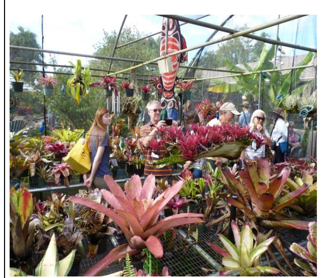
One of John's shade houses - just a riot of color!