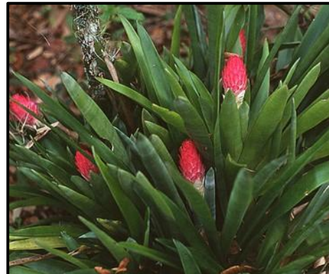
Quesnelia testudo

stalk is cone-shaped with bright red bracts with tiny blue flowers. They can grow in shade or sun and are cold tolerant. I have mine planted at the base of a sabal palm and it sends up its stoloniferous pups which root on the palm trunk and climb upwards. Others like Q. marmorata and its cultivar ‘Tim Plowman’ are vase shaped like Billbergias and grow best in bright light. Their nodding inflorescences only last a few days but are quite spectacular.