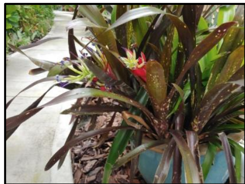
Billbergia ‘Hallelujah’ (Jane Howells)

We love to see pictures of bromeliads in our members’ gardens.