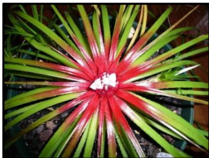
Sincoraea hatschbachii (Jay Thurrott)

Sincoraea : About five years ago taxonomists reclassified 11 species of Orthophytum into this genus. These plants have a ‘sunburst’ pattern to their leaves and no stems to their blooms in contrast to the visible flower stem of those remaining in the genus Orthophytum . These new names are: Sincoraea albopicta , amoena , burlेमarii , hatschbachii , heleniceae , humilis , mucugensis , navioides , ophiuroides , rafaelii , and ulei . The genus was named after the Serra do Sincorá, a mountain ridge in northeastern Brazil where these 11 species occur.