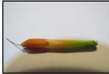
Flowers are green, yellow and red.