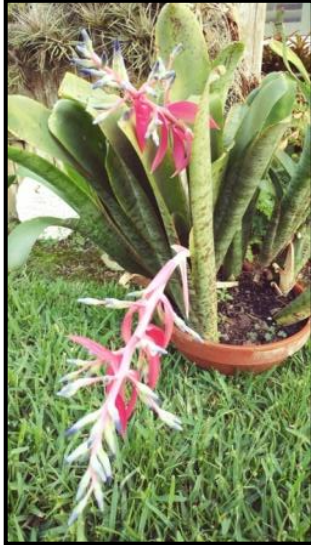
Q. marmorata (J. Villa-Lobos)

Sincoraea : About five years ago taxonomists reclassified 11 species of Orthophytum into this genus. These plants have a ‘sunburst’ pattern to their leaves and no stems to their blooms in contrast to the visible flower stem of those remaining in the genus Orthophytum . These new names are: Sincoraea albopicta , amoena , burlेमarii , hatschbachii , heleniceae , humilis , mucugensis , navioides , ophiuroides , rafaelii , and ulei . The genus was named after the Serra do Sincorá, a mountain ridge in northeastern Brazil where these 11 species occur.