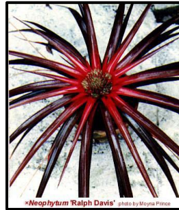
xNeophytum ‘Ralph Davis’ is now xSincoregelia ‘Ralph Davis’

Other name changes: While researching Sincoraea I came upon an article listing the reclassification of species in xNeophytum as now belonging to xSincoregelia . Remember - xNeophytum is a bigeneric cross between an Orthophytum and a Neoregelia . You may not think this is important, but if you are entering a bromeliad in a show, it is important to have the proper scientific name.