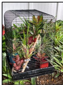
Various bromeliads (Sherrie Thompson)