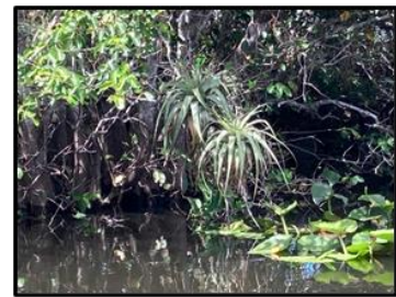
Tillandsia utriculata