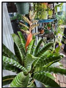
Aechmea chantinii