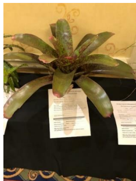
Neo. 'Cosmic Dream'