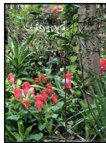
Billbergia pyramidalis (Calandra Thurrott)