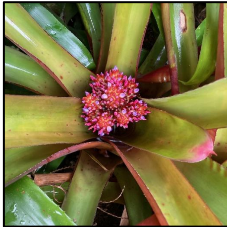
xNeomea 'Equisita' (Bill Hazard)