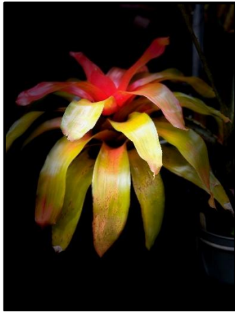
Neoregelia 'Tangerine' (Calandra Thurrott)