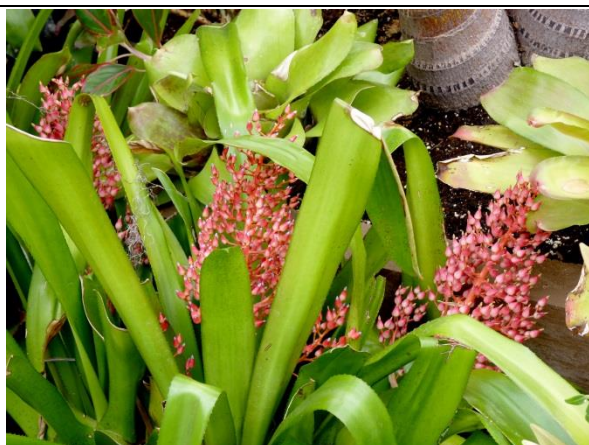
Aechmea fulgo-ramosa as a landscape plant in S. Padre Island.