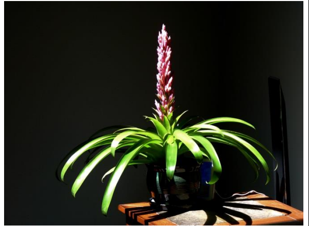
New hybrid Guzmania x Vriesea was on sale at McCrory's Nursery – one of the tours available during the event.