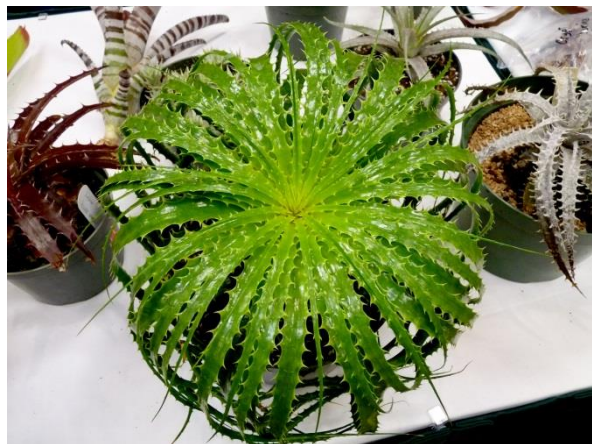
Encholirium horridum – entry in the SW Guild Show