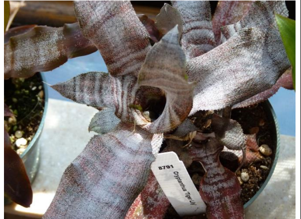
Cryptanthus 'Tiger Lily' at John Bordman's home – one of the tours of gardens during the Extravaganza.

...and, here are a few more pictures from the Extravaganza in Orlando: