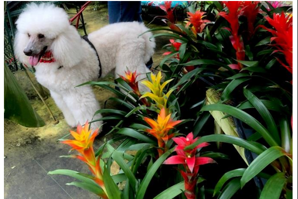
Even the weather was perfect for the event (well, at least it was on Sunday). Then, to cap it off, a food truck was parked in front of the main greenhouse and provided excellent fare at a reasonable price.