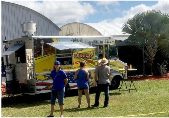
All in all, it was just a great way to spend an afternoon.