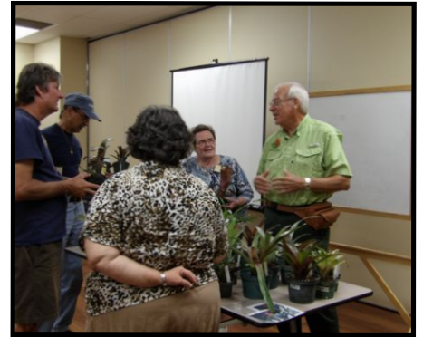
Conversation with our Speaker