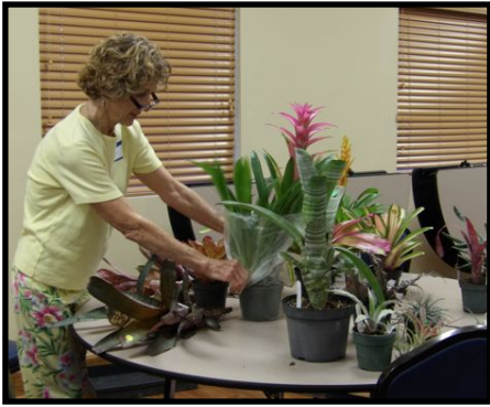
Shopping Before the Meeting