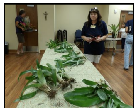
At the Raffle Table