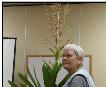
Taller than She Is