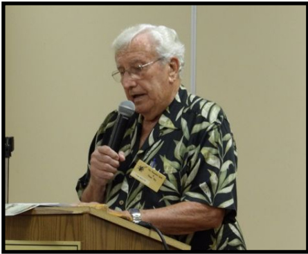
Call to Order