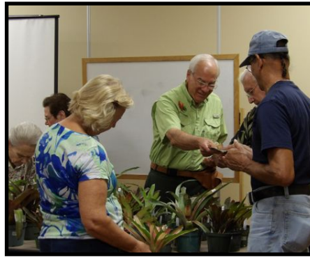
... And More Shopping