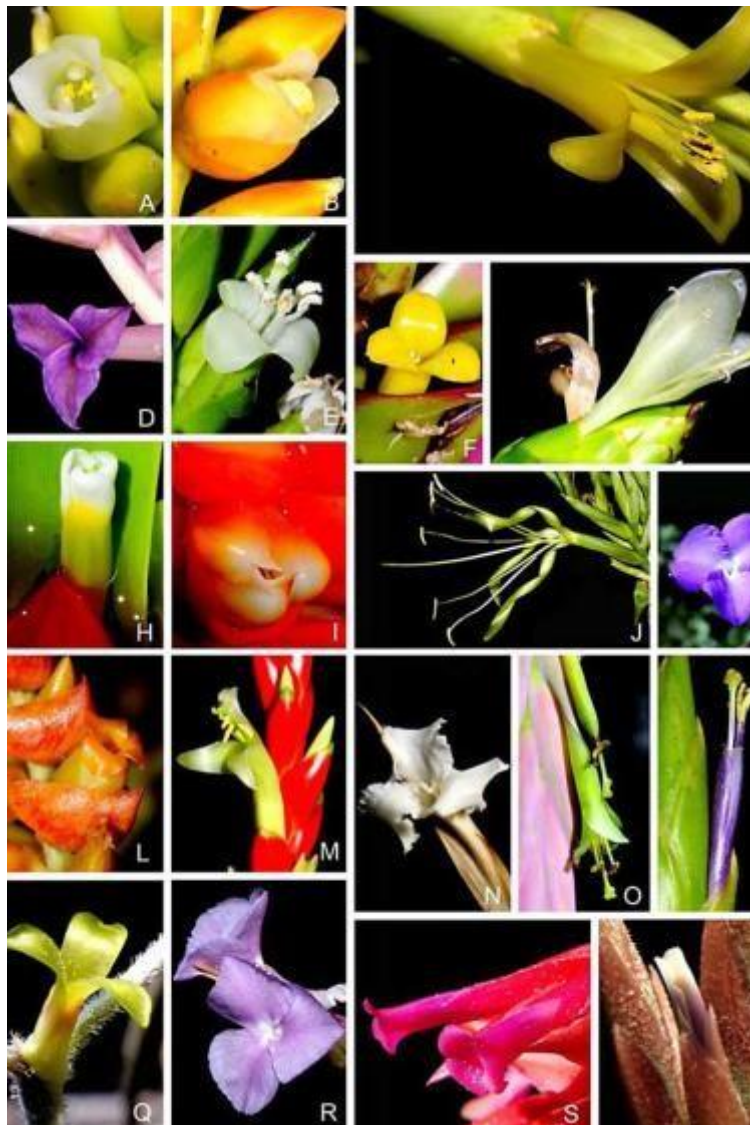
FIGURE 2. Corolla types in Tillandsioideae. A. Catopsis hahnii (Leme 2482; urceolate). B. Catopsis pisiformis (Leme 2410; urceolate); C. Gregbrownia lyman-smithii (Leme 4655; tubular with spreading petal blades);