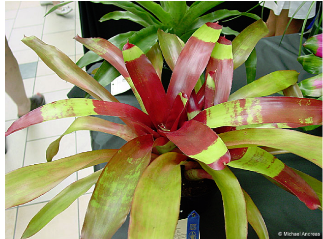
Neoregelia 'Red Band'