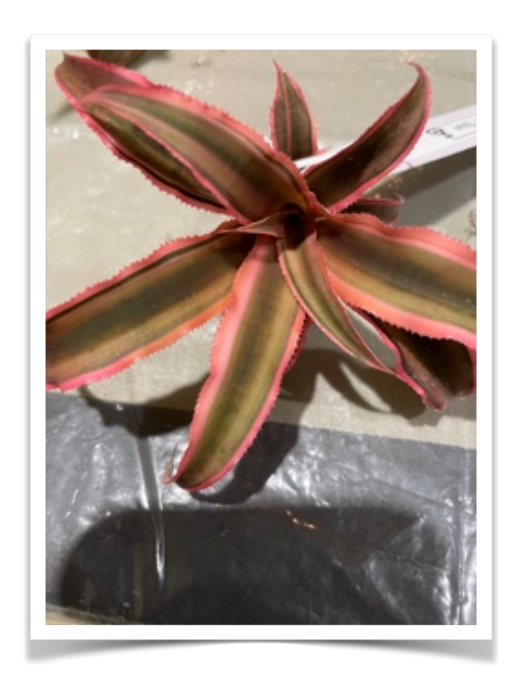
Cryptanthas pink star