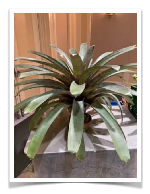
Vriesea Egyptian sage